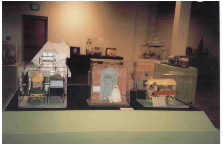
Arab Wagons and Door Way