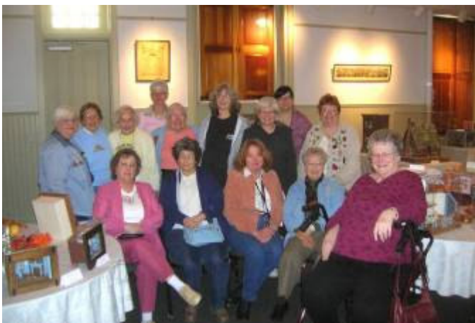
Exhibitors relaxing after a hard day's work

In October, Maryland Miniatures Unlimited once again hosted an exhibit at the Historical Society of Baltimore County, located in the old Alms House in Cockeysville, Maryland. Although attendance was down from the previous year, the exhibit was well-received by those who viewed it.