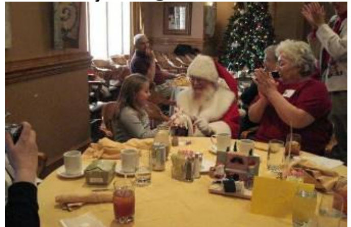
Santa greets the youngest