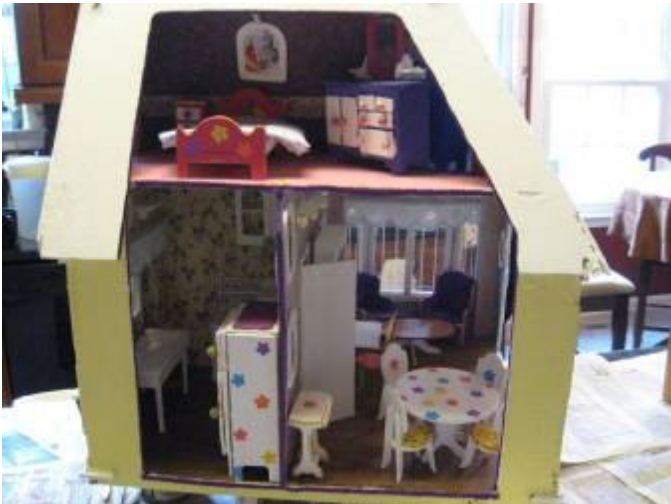
Another view of the interior