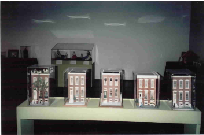
Baltimore Row Houses