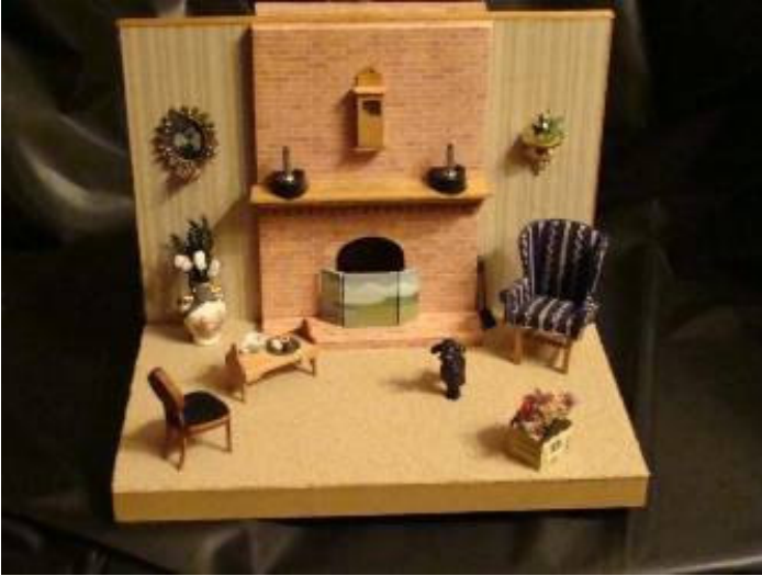
Sample Holiday Party