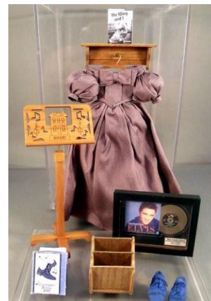
Wonderful Convention Souvenirs