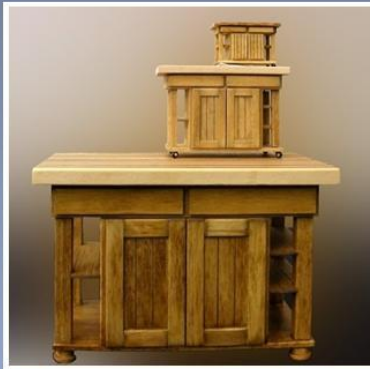
Creativity Center shown in 3 scales

October 1, 2011 10: 00 am to 4:00 pm John Marshall Library 6209 Rose Hill Drive Alexandria, VA 22310