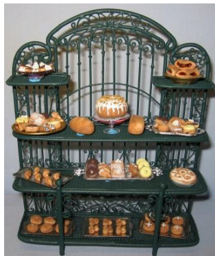
What the finished project will look like!